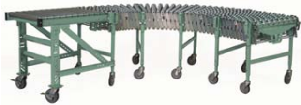
Roach flexible Conveyor with optional Impact Load Table.