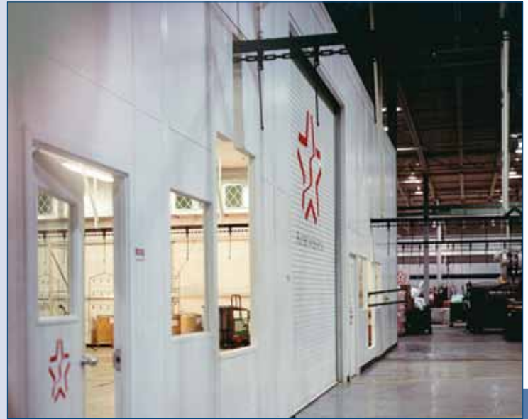
PortaMax wall with keyhole conveyor opening supporting conveyor from roof structure.

With PortaMax XTRA-TALL modular walls, you can effectively divide your plant space – from floor to roof – or create freestanding in-plant buildings taller and stronger than ever before possible with modular construction. PortaMax gives you exactly the enclosed space you need to control dust, temperature, humidity, noise, and other environmental needs. PortaMax is moveable, reusable, and designed to connect to either an overhead steel structure or as a self contained, freestanding structure with a roof deck.