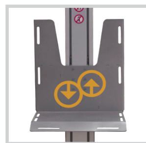
Platform slots for securing loads with bungees or straps.